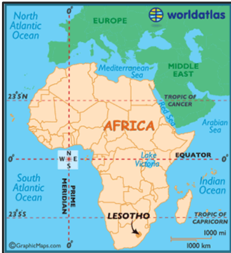
Location of Lesotho in Africa